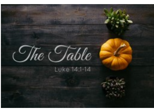
Sermon audio and reflection guides available at southelkhorncc.org/sermons

Dec. 9 Children's Choir Dec. 24 Two Services, 4:00 PM & 7:00 PM