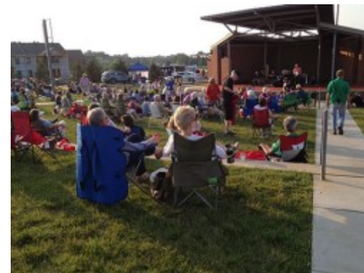
Moondance Amphitheater, 1152 Monarch St., Lexington

Bring a lawn chair or blanket, food, and drinks. Kids and friends are welcome!