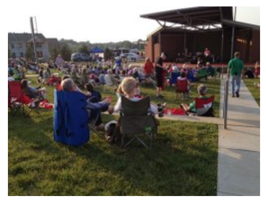
Moondance Amphitheater, 1152 Monarch St., Lexington

Bring a lawn chair or blanket, food, and drinks. Kids and friends are welcome!